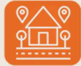
Main Road Market Property