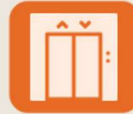
2 Branded Lifts