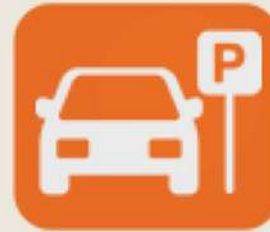
Stilt car parking