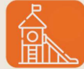
Kids Playing Area